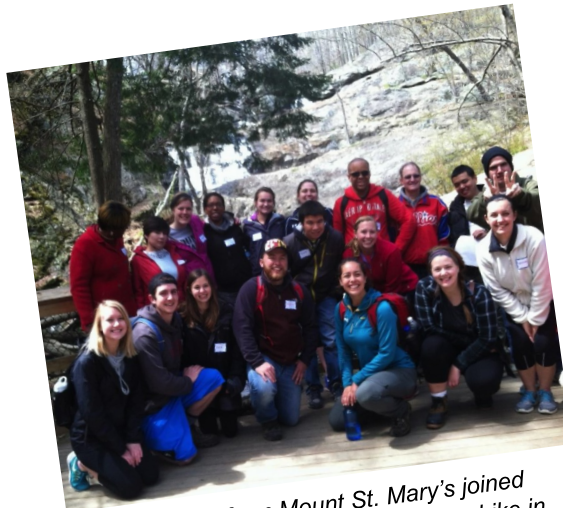
Students from Mount St. Mary's joined individuals served by The Arc on a hike in a nearby park. Fun for all!