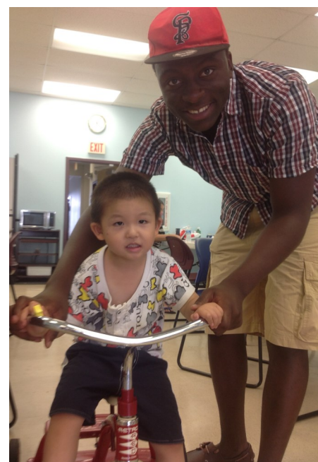
Parents' Day Out continues to be a fun-filled event for children and volunteers.