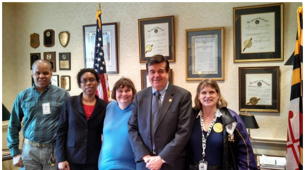
The Working Together Advocacy Group participated in Developmental Disabilities Day at the Legislature in Annapolis.