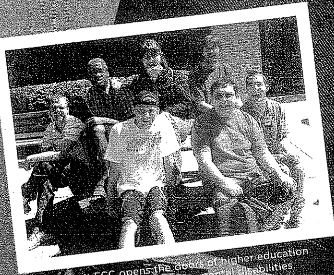
LEAP at FCC opens the door of higher education for students with developmental disabilities.